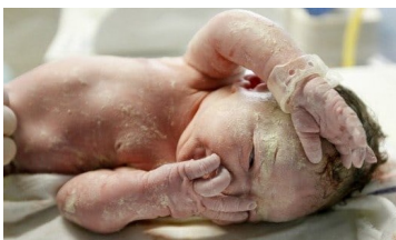
FIGURE 3. Timeline for skin development.

Ceramide rich fetal coating with vernix caseosa.